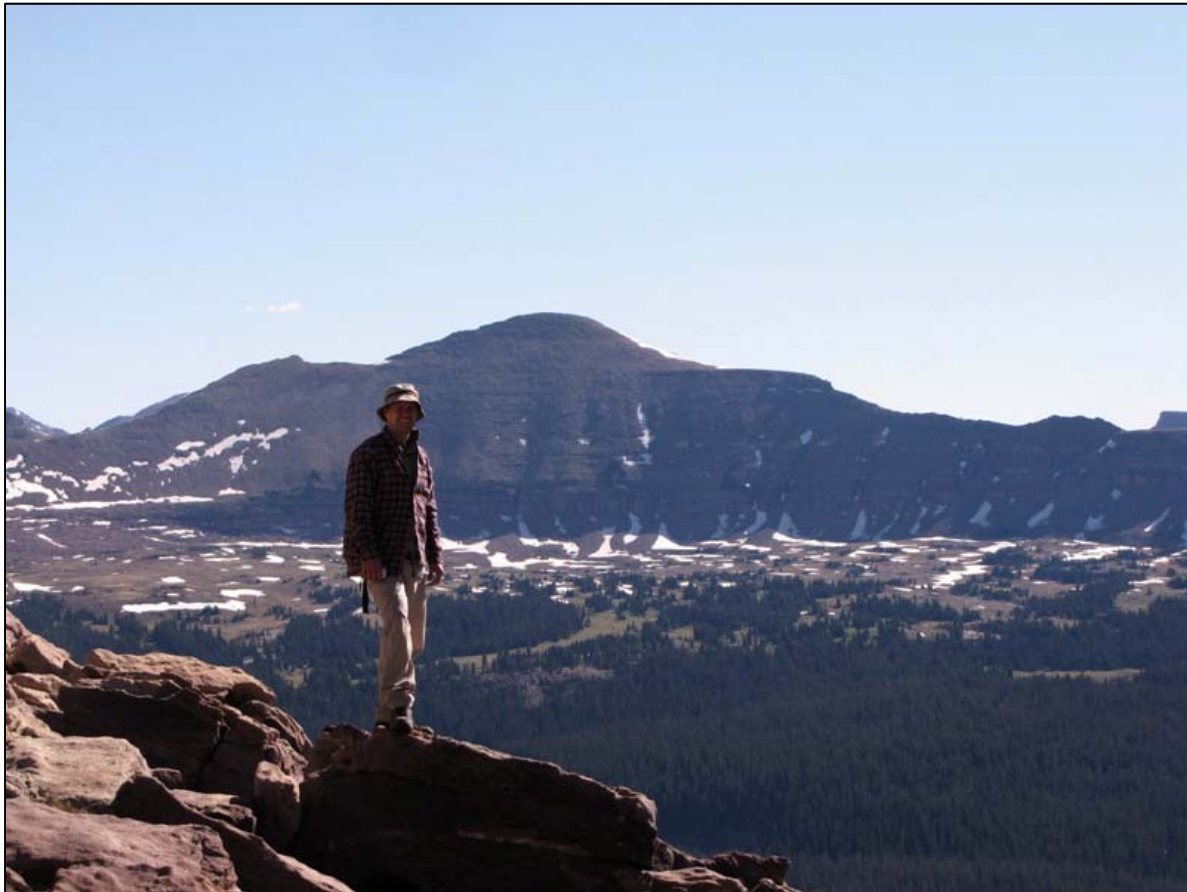
Looking east into the Rock Creek drainage from Rocky Sea Pass

The High Uinta Wilderness is a spectacular wilderness in the northeast corner of Utah near the Wyoming border. This sixty mile east-west range contains the highest peaks in Utah, Kings Peak being the tallest - 13,528'. This range harbors many lakes with Brook, Cutthroat, Rainbow, Grayling and a few rare Golden Trout. Large Grayling in Allen Lake drew us to this area.