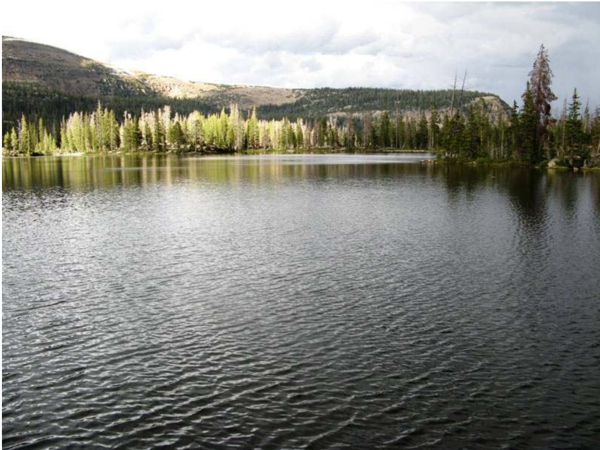
Searching for Golden Trout at Joan Lake

Before leaving we wanted to try our luck at a rare Utah Golden. We drove six miles to Echo Lake on Murdock Basin Road which was a very rocky four wheel drive road. The lake contained mostly Brook Trout with the occasional Golden. I climbed to Joan Lake while my brothers fished Echo Lake but all I found were Brook as well. No Golden's this time! We didn't fish very long due to a thunderstorm that produced a lot of lightning. Those storms are an awesome experience in the mountains.