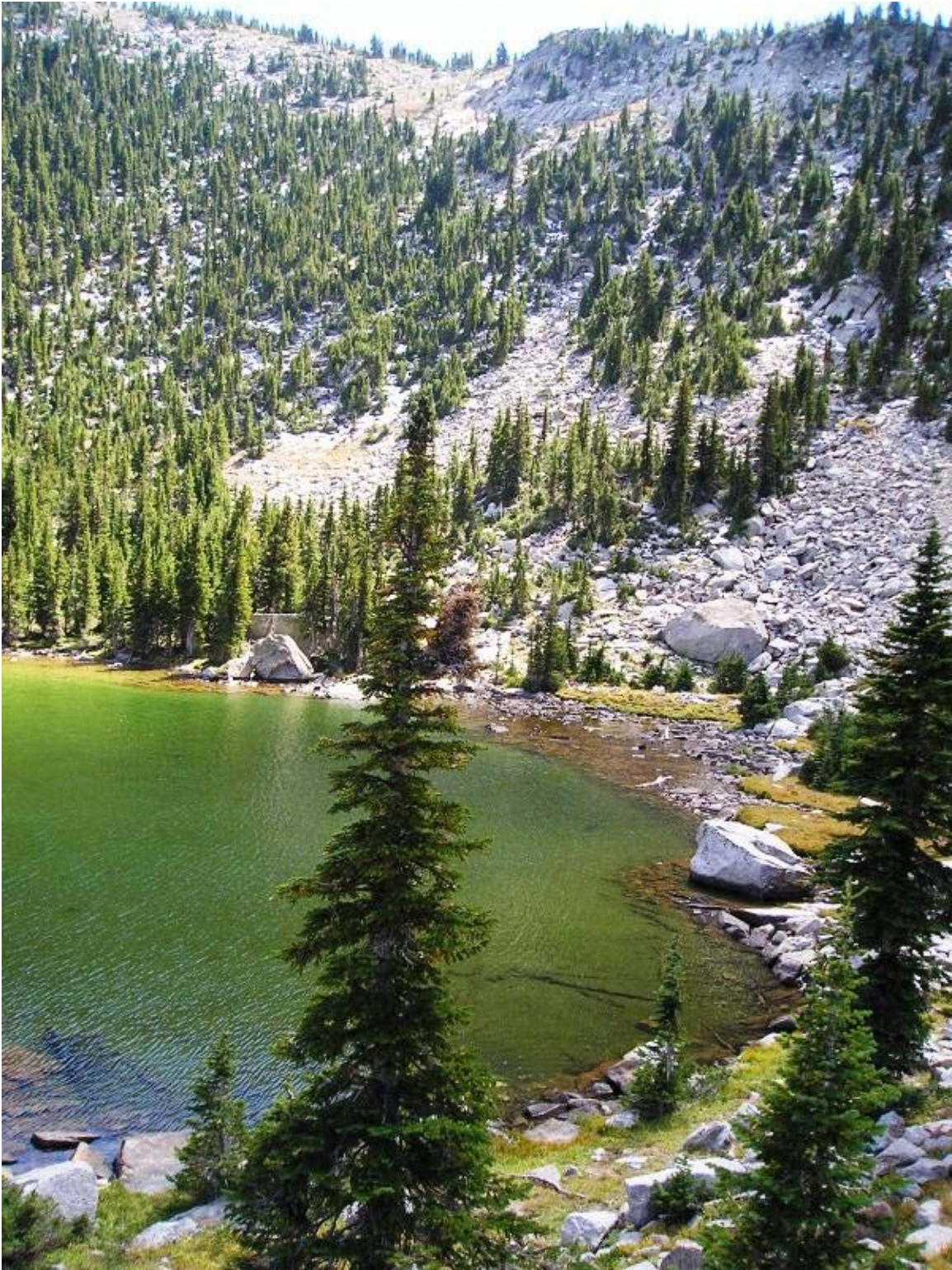
The highest lake

It was a three mile hike to the lowest lake and four miles to the highest. There was also a good chunk of elevation gain but I didn't keep track. I didn't see fish in the two top lakes but there were plenty of fish in the two lower lakes.