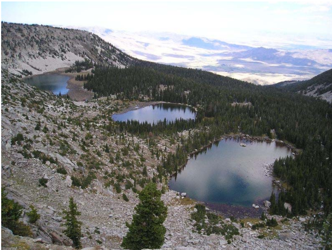
The three highest Independence Lakes

Independence Lakes are just over 9,000 feet and one of only two alpine lake areas in southern Idaho; the other lake being Bloomington Lake near Paris, ID. From the bench above the lakes you can see the row of all four lakes.