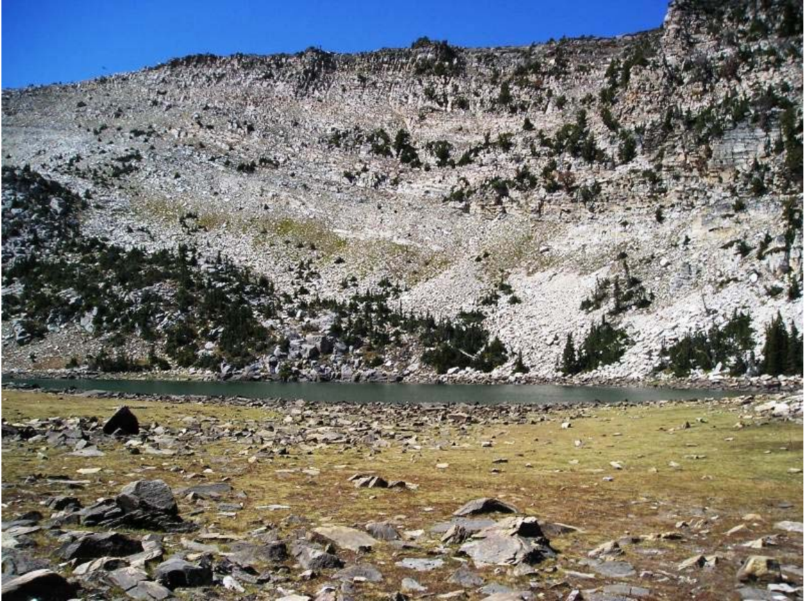
The second lake