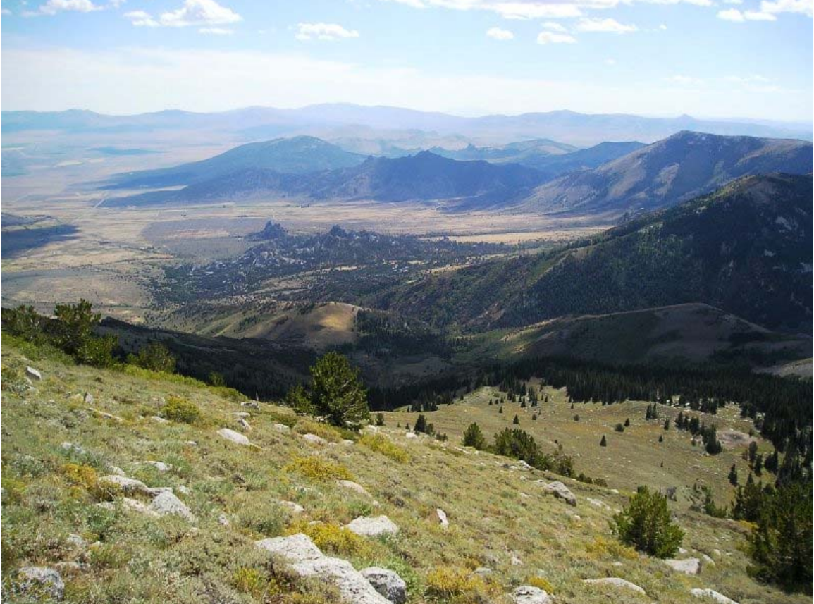
Looking south at Castle Rocks State Park