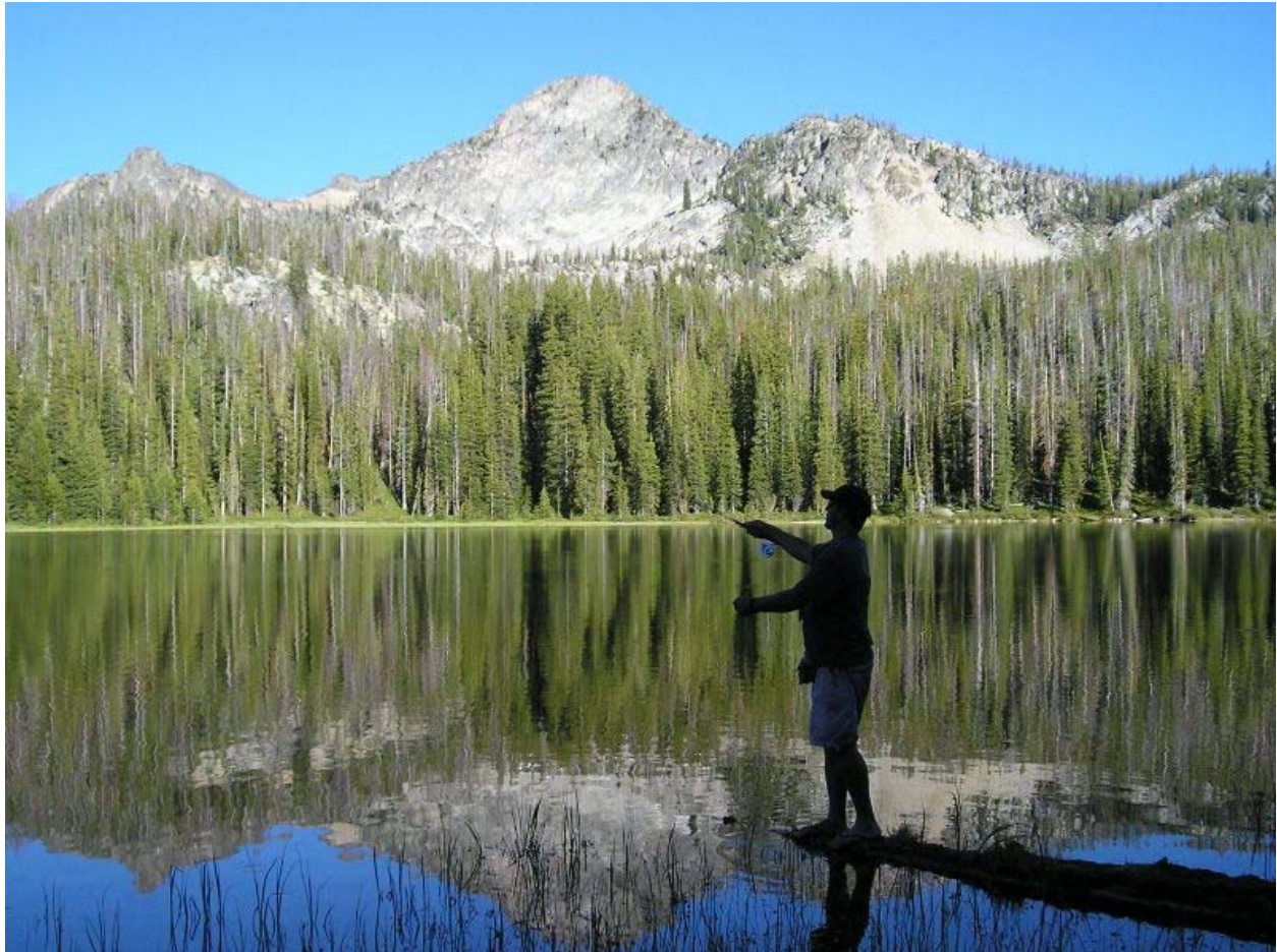
Fishing near our campsite