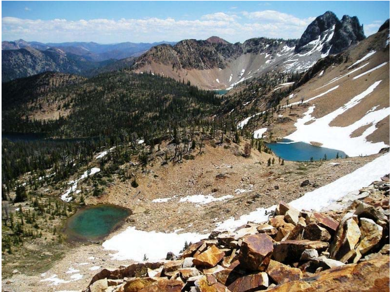
The view from the ridge looking down at Crimson Lake