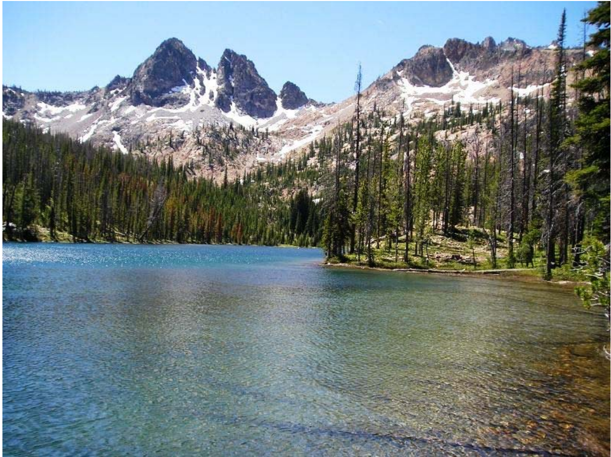
Beautiful Crimson Lake